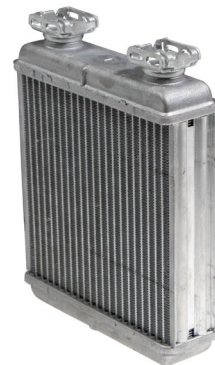
P/N TEM 551467 Heater Core VIO 58,569 (15-08) Smart Fortwo