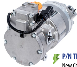
P/N TEM 276643 New Compressor VIO 172,826 (23-21) Hyundai Elantra (22-17) Kia Niro