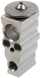
P/N TEM 217712 Expansion Valve VIO 697,079 (23) Lexus RX350 (23-22) Toyota Tundra