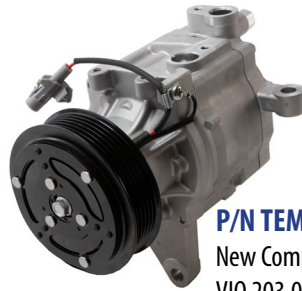
P/N TEM 276631 New Compressor VIO 203,069 (23-17) Subaru Impreza (19-18) XV / XV Crosstrek