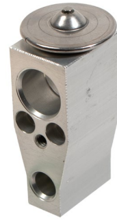
P/N TEM 217713 VIO 458,632 (23-21) Lexus GX460 (23-21) Toyota 4Runner