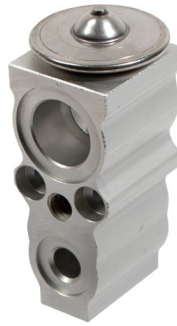
P/N TEM 217719 VIO 461,217 (23-21) Cadillac Escalade (23-21) Chevrolet Tahoe