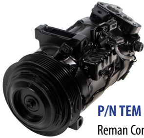
P/N TEM 258819 Reman Compressor VIO 1.2 M+ (23-19) infiniti QX50 (22-17) Nissan Rogue / Sport

NAPA® Temp is pleased to announce the release of 7 new compressors with coverage for over 1.7 M+ VIO!