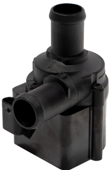
P/N TEM 299085 Electric Coolant Auxiliary Pump VIO 474,546 (24-17) Audi A Series (24-16) Q Series